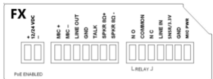
IP7- FX Connectors